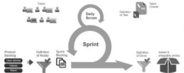
Figure 2: The Basic Principles of the Scrum Process

Software development using the ASD method has several models, and the model used in this study is the Scrum model (Al-Saqqa et al. , 2020; Curcio et al. , 2019; Dima & Maassen, 2018; Jain et al. , 2018). The Scrum method divides software development into small, iterative processes which are usually called sprints. The Scrum model on ASD is shown in Figure 2 below.